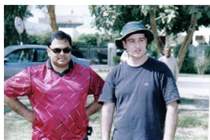
Which enigmatic team shall I play for in '08?