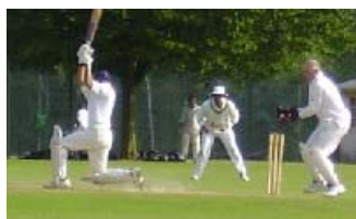
104 not out v NBW in 2005